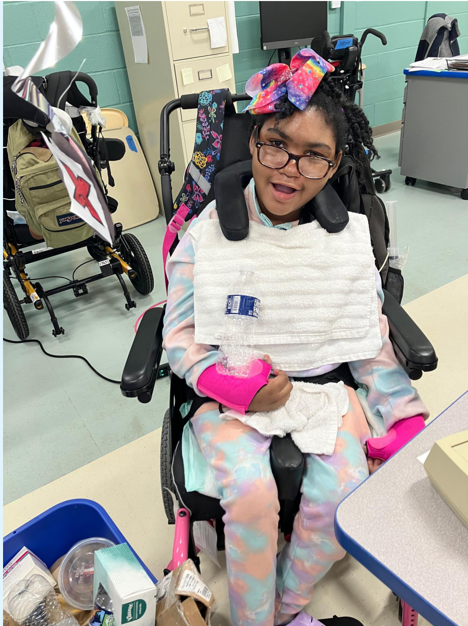
A student at C. Elizabeth Rieg Regional demonstrates recycling.

The Prince George's County Department of the Environment's Resource Recovery Division and Keep Prince George's Beautiful (KPGCB) recognizes exceptional efforts in recycling and waste diversion.