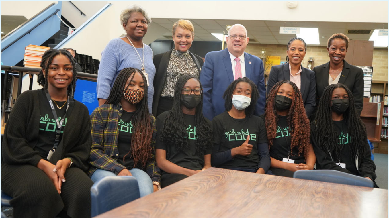
Governor Larry Hogan visited Eleanor Roosevelt High School to meet with students and staff who have benefited from computer science education funding.