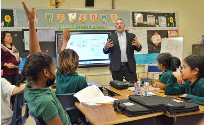
At Fort Foote Elementary School, U.S. Secretary of Education Miguel Cardona toured classrooms to see how American Rescue Plan investments have enhanced students' learning experiences in reading and math!