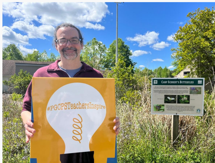
Teacher Appreciation Week

Last week, we held a contest to nominate a teacher who shines bright in your school community. Self-nomination was also allowed. Winners will be announced next week along with special offers for all educators!