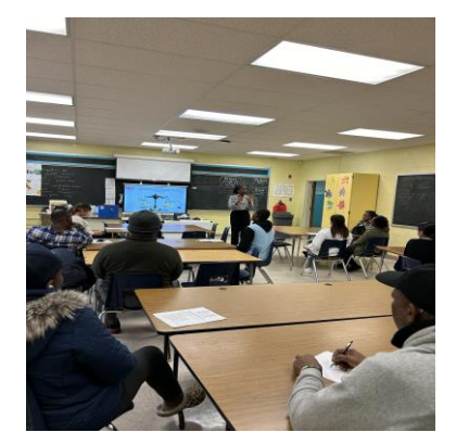
Parents as Partners Workshop