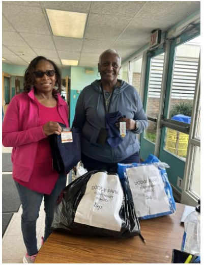
St. Joseph Catholic Church Uniform Donation