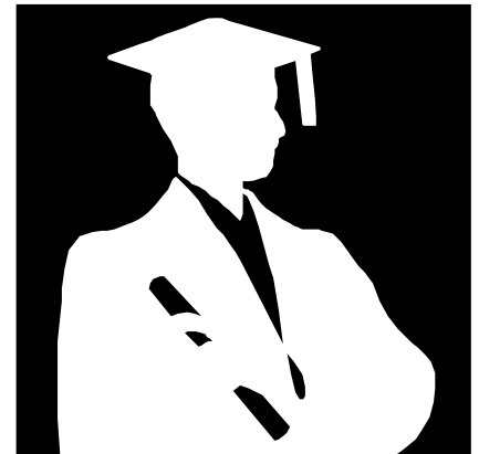
Class of 2010 "Exceeding Expectations"

Dues are to be turned in no later than November 6, 2009 in order for your order to be placed in a timely manner!