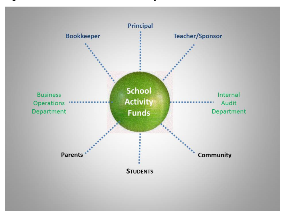
Figure 1: KEY PLAYERS - Student Activity Funds