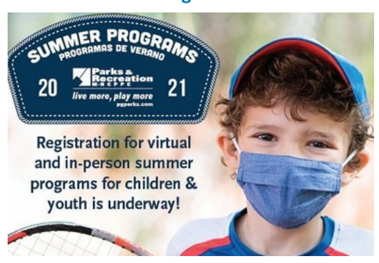
Parks & Recreation Summer Programs

Maryland-National Capital Parks and Planning Commission is offering virtual and in-person full-day and half-day camps for children and teens ages 3 and a half through 17!