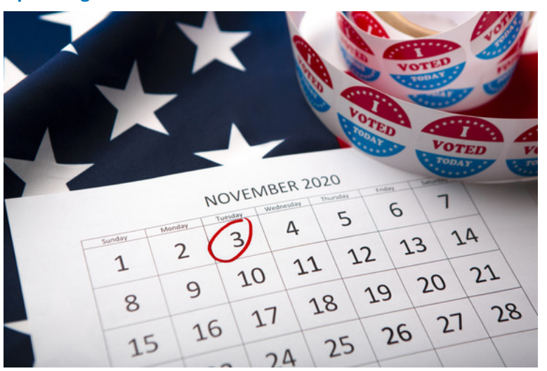
Tuesday, Nov. 3 — Election Day: All schools and offices closed.