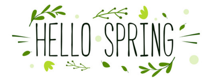
March 29 - April 1: Spring Break — Schools Closed

April 2 - 5: Spring Break/Easter Holiday — Schools and Offices Closed