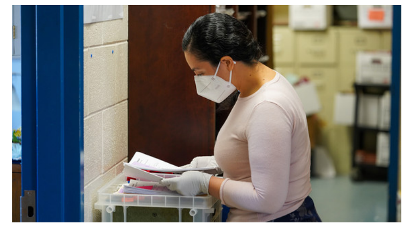
Videos: preparing for reopening.

View the ways PGCPS is preparing to safely welcome back students to schools next month, plus answers to <u>frequently asked questions</u> around safety, logistics, student activities and more.