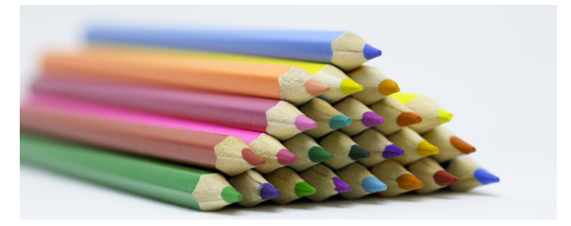
Sign up for Pre-Kindergarten for the 2021-22 school year!