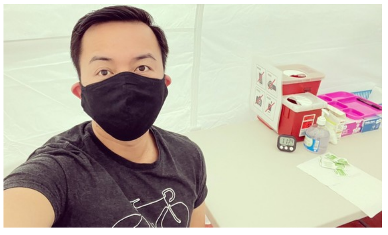
Take a neek inside the first weekend of the PGCPS employee vaccination program!