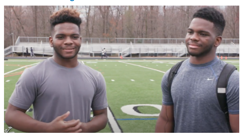
PG13: "Rebuilding the Team"