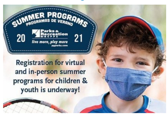
Parks & Recreation Summer Programs

Maryland-National Capital Parks and Planning Commission is offering virtual and in-person full-day and half-day camps for children and teens ages 3 and a half through 17!