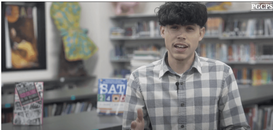
PGCPS students are taking the lead in warning peers about the dangers of fentanyl.