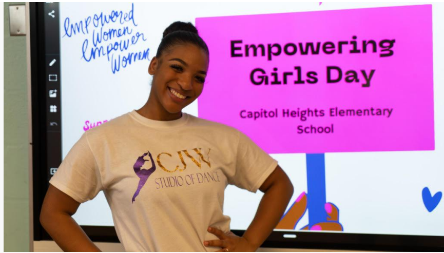
Students and staff at Capitol Heights Elementary School closed out Women's History Month with its annual Girls Empowerment Day, featuring special guests and an entire day of hands-on activities!