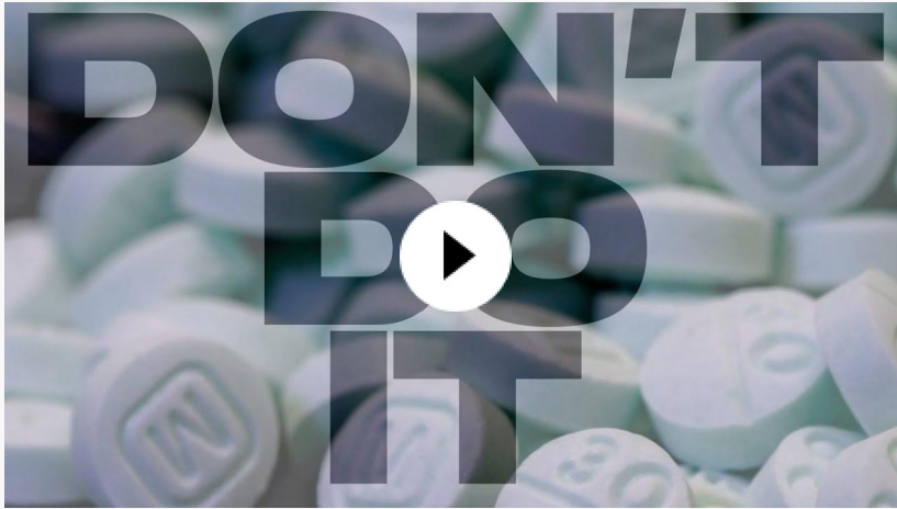
Fentanyl PSA in English