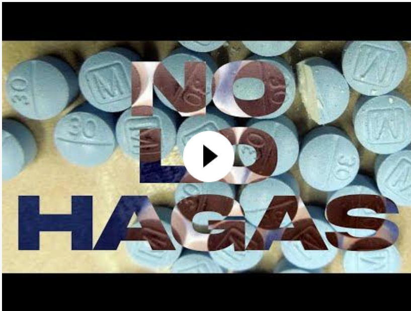
Fentanyl PSA in Spanish